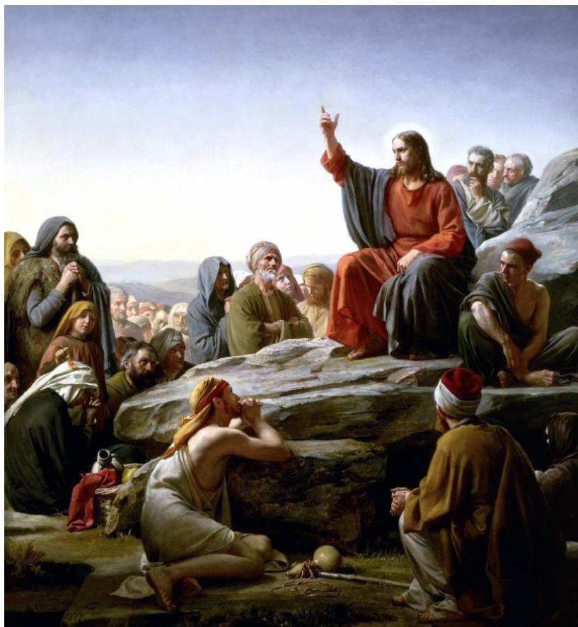
Sermon on the Mount, by Carl Heinrich Bloch, Danish Painter, died 1890. Public domain.